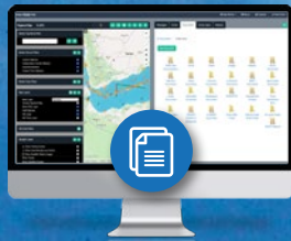
File exchange, documents and forms (coordination-oriented)