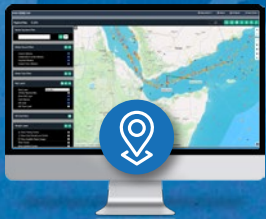
Advanced mapping + vessel intercept (coordination-oriented)