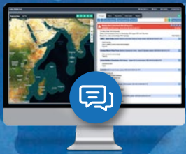
Multilingual messaging, chat, alerts (communication-oriented)