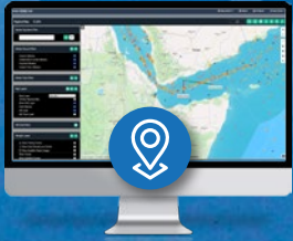
Advanced mapping + vessel intercept (coordination-oriented)