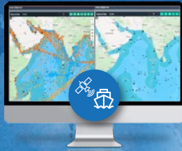
Satellite-based Data Feeds (coordination-oriented)