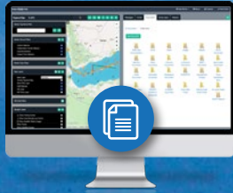
File exchange, documents and forms (coordination-oriented)