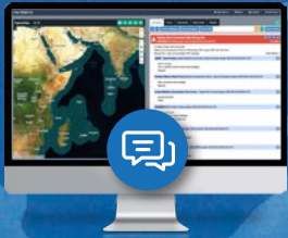
Multilingual messaging, chat, alerts (communication-oriented)